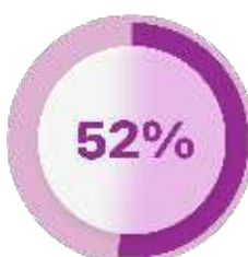
The NADs cooperates with the deaf women's clubs/committees