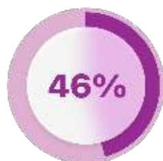
Board Members of the NADs are hearing and deaf women

Out of 120 female board members, 110 are deaf and 10 are hearing.