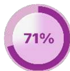
Staff Members of the NADs are hearing and deaf women