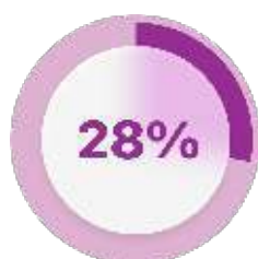
Staff Members of the NADs are deaf women

Out of the 29 NADs, 130 staff members are deaf women, 93 staff members are deaf men, 42 staff members are hearing men and 199 staff members are hearing women.