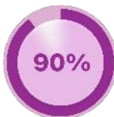
The NADs have at least one or more women in leadership roles

90% of the NADs state that there is at least one deaf woman in the association who is involved in a leadership role in both the board and/or the staff level and has responsibilities that are part of a NAD's management work. The number of key involvements by deaf women in the NADs are 291.